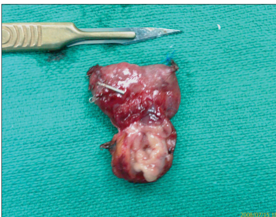
Figure 1: Segment of jejunum with duplication cyst (laid open) showing fleshy rugous mucosa (arrow)

RBC pool scan at the time of massive bleeding showed the suspicious area at left hypochondrium and subsequent Meckel's scan showed a suspicious hot spot adjacent to greater curvature. At this point, our differential got narrowed down to possible duplication cyst and was confirmed later at exploration. RBC pool scan is popular investigation for detecting active haemorrhage; however, it has limited role in occult bleeding. Although, Meckel's scan has a sensitivity up to 80% for detecting ectopic gastric mucosa in Meckel's diverticulum, its sensitivity decreases significantly in the event of massive bleeding with hemoglobin below 11 gm %. [5,6] Further, with regard to intestinal duplications, sensitivity of Meckel's scan depends on the size of