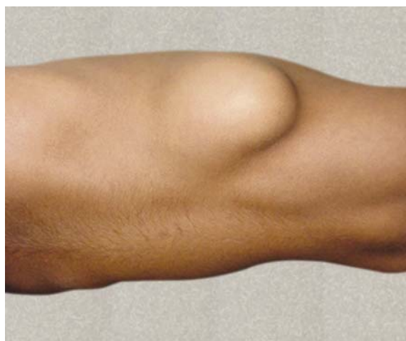
Fig. 47.4: The lumbar hernia in a child, with a circular defect in the abdominal wall muscles. The defect was repaired primarily with success

by the aponeurosis of the transversus abdominis muscle arising by fusion of the layers of the thoracolumbar fascia formed by the external oblique and latissimus dorsi muscles.