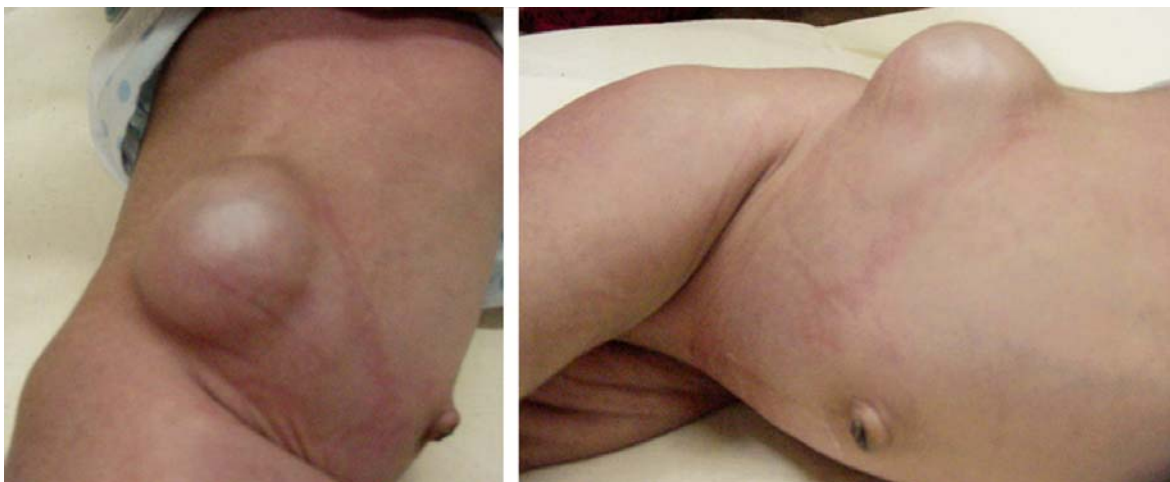
Fig. 47.3: Right side lumbar hernia in a 1-month-old child. There was a well defined circular defect in the abdominal wall muscles. With adequate mobilization, the defect could be closed primarily