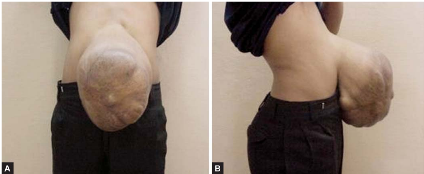
Figs 47.2A and B: A ten-year-old boy presenting with postomphalocele large ventral hernia with a narrow neck and severe lumbar lordosis. The CT scan showed presence of most intestinal loops and the liver in the sac outside the abdomen. The vertebral spine, the aorta and the inferior vena cava were found displaced anteriorly to the level of the anterior abdominal wall

fascial closure of wound to the prior surgery. Even after repair, recurrence rates approach 20-45%. However, its incidence of incisional hernia in children is much lower due to good muscle strength, better wound healing ability and the routine practice of skin crease incisions.