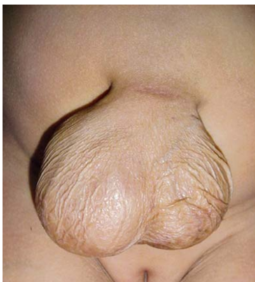
Fig. 47.1: A small ventral hernia in a girl that can be repaired primarily

after reducing the hernial contents inside the abdominal cavity (Fig. 47.1). In case of difficulty in bringing the muscles together in the midline, additional techniques may be adapted and these include; stretching or the mobilization of the abdominal wall from lateral sides, raising of the anterior rectus sheath vertical flaps on one or both sides and suturing these together in front of the intestine. In cases of anticipated difficulty in closing the hernia, a slow pneumoperitoneum may be