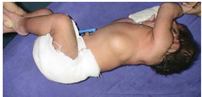
Fig. 47.6A: Thoracolumbar hernia in a newborn presenting with respiratory distress

The hernia may be an isolated defect in the lumbar region, well circumscribed or it may be associated with hydrometrocolpos, meningomyelocele, anorectal malformation, undescended testis and multiple other anomalies. 17,18,20 The diagnosis of the hernia may be delayed due to its juxtaposition to a posterior meningomyelocele and may result in incarceration. 20 Acquired lumbar hernia generally can be attributed to surgery,